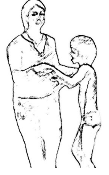
Figure 4. Escorting Jonah into the kitchen to clean up