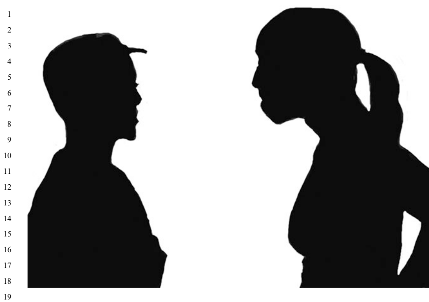
Figure 2. (Example [2], line 9) Joint attention between Mom and son